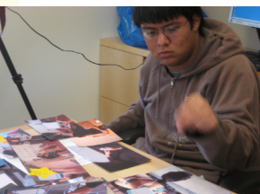
Teen co-creation workshop session

Pre-design research is defined as human-centered research with the objective to learn about a particular population in order to identify opportunities for meaningful and relevant design intervention. Our research utilizes the "probes" methodology in combination with in-person interviews and begins by inviting participants to engage with a particular activity—a cultural probe—which could range from a highly directed to very interpretative exercise.